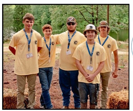
Battery Creek High School Environthon Team 2023

Green Steps is a program designed to help South Carolina schools earn awards for establishing sustainability projects where students learn, do, and teach others. This was our 2nd year mentoring Bluffton Middle School students (right) with recycling and reusing, composting, litter prevention, and habitat restoration.