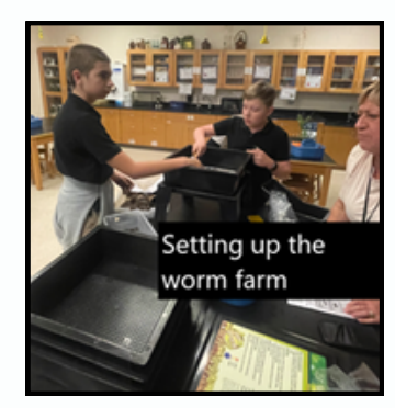
Bluffton Middle School student repurposes a plastic container to create a bug house for helpful garden insects (left). BLMS students set up a worm farm. Worms will be released into flower and vegetable garden beds (right).