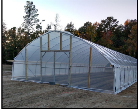
Seasonal High Tunnel Farmers can begin crops early to extend the growing season

Please be aware that you need to notify Farm Services Agency (FSA) with any land clearing requests prior to starting the clearing, stumping, ditching, etc. at 843-726-5313.