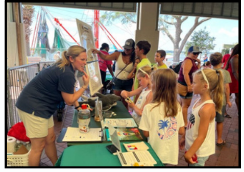
Beaufort Water Festival Kids' Day.

August 2022: STEAM Festival October 2022: Shrimp Festival January 2023: Oyster Festival April 2023: Soft Shell Crab Festival, and Birthday for the Birds. We also organized Hilary explained all about sharks at the and presented Earth Day at the Port Royal Farmers Market.