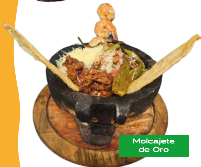
Molcajete de Oro