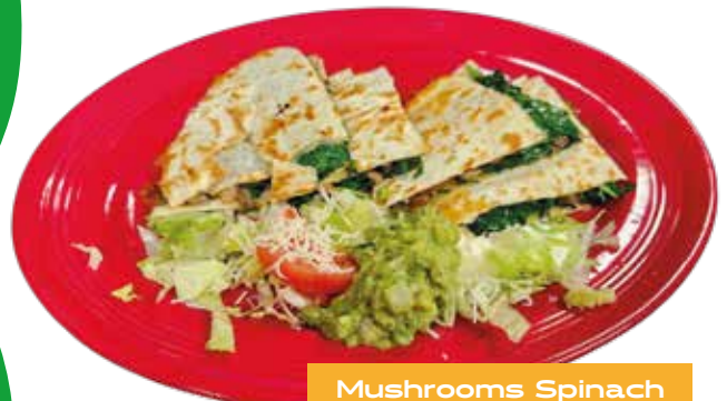
Mushrooms Spinach Quesadilla