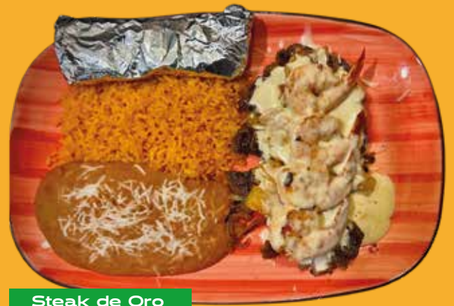
Steak de Oro