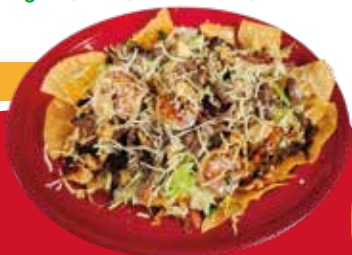
Nachos al Carbón

Ground beef, black beans, pico de gallo, corn, sour cream, jalapeño and black olives.