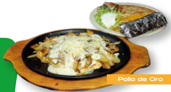
Pollo de Oro