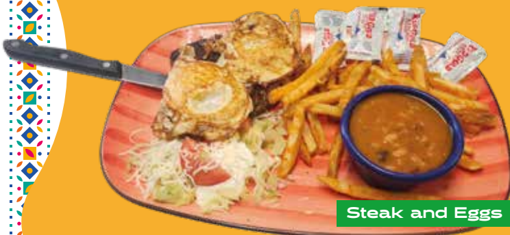
Steak and Eggs