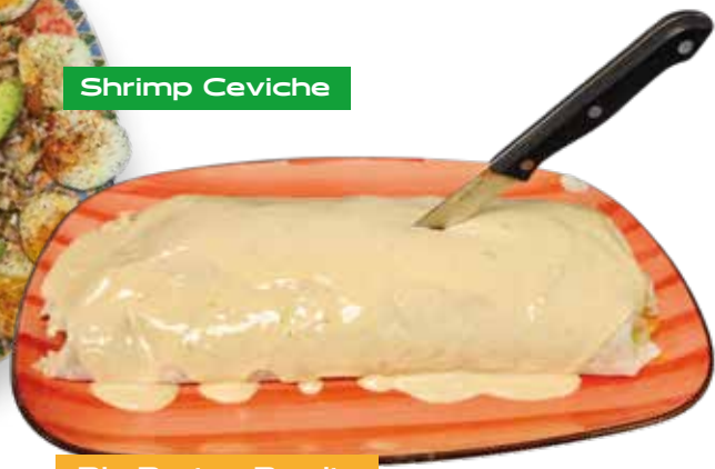
Big Brutus Burrito