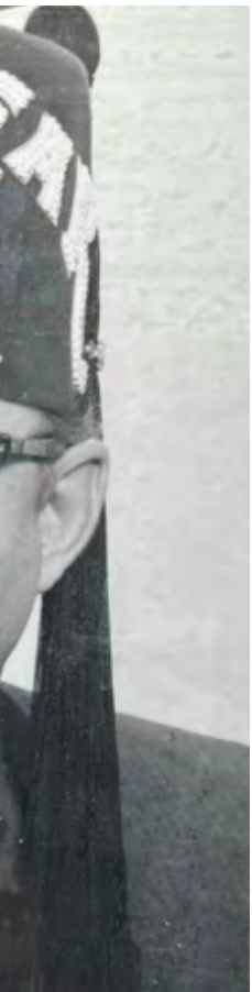
San Antonio Alzafar Potentate in 1981.