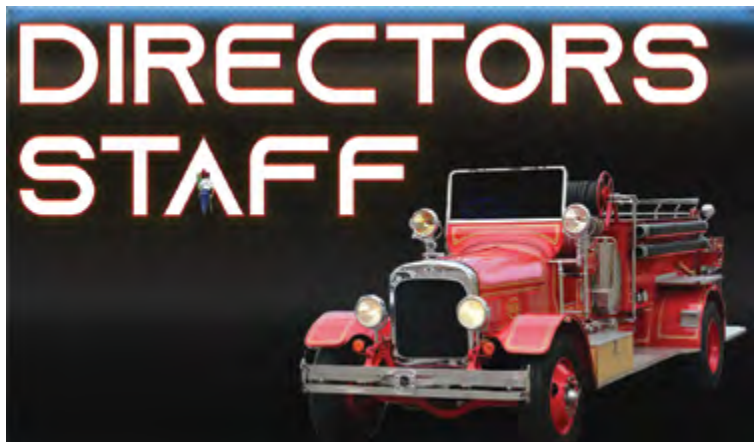
ALZAFAR DIRECTORS STAFF

The Directors Staff is still chugging along, our article has been absent to long. First things first is we are happy to report we were able to perform a second section for the Shrine ceremonial! We had a few parameters to abide by and it seems all that participated had a great time. I was able to come up with some great team building activities , this is the new direction were going in . we look forward to the new style of competing.