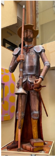
Guinness World Record Marzipan Don Quixote, Toledo Spain

Marzipan and Don Quixote are so famously intertwined that one of the local Marzipan shops built a giant Don Quixote out of Marzipan and obtained the Guinness World Record! The following day we took a scenic drive through Don Quixote's La Mancha to Andalusia. We toured the amazing Mezquita, then to Granada, site of the Alhambra palace, home to Queen Isabella and King Ferdinand.