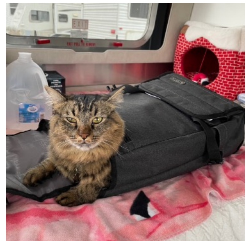
Milo Majkowski burrowed in a backpack, less than amused at the RV park in Garden City, KS out behind the T/A, rife with migrant workers and flies, and a bit more than a whiff of cow in the air. I'm sure we've all survived a couple stinkers, Milo.