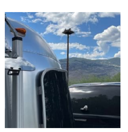
I'd be surprised if anyone told me they've stayed at Lemhi Hole Access in Salmon, ID. I'd have to ask the osprey family above our Airstream for confirmation.

(L) Perhaps THE most interesting stop was the Experimental Breeder Reactor-I (EBR-I) Atomic Museum in Butte County, ID. Part of the Idaho National Laboratory, it was the first power plant to produce electricity using atomic energy ... IN 1951!!!