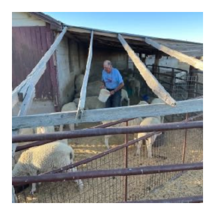
This is a WBCCI Courtesy Parking plug. Our sheep farmer hosts in Buhl, ID, talked us into staying a couple extra nights so we could join them at the Idaho Club's installation rally in Picabo. They named us their honorary co-hosts.