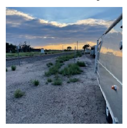
We love city parks. 3 examples: Tourist Camping, Odessa, WA (3 nights free, park on grass, shared water and 20 amp); Karrer Park, McCook, NE (3 nights free, 50 amp at site, shared water, dump station); Hugo Railway Park lot at the Hugo, CO city park (dry camping, must love trains—the tracks are RIGHT THERE!)