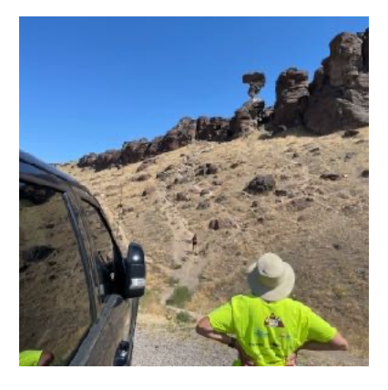
Kim staring in wonderment at Balanced Rock in Buhl, ID. There's a spectacular county park in the canyon a mile up the road.