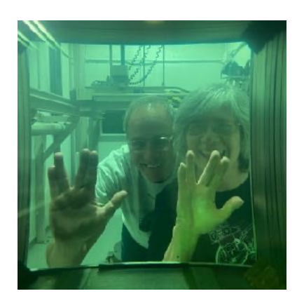
If you're lucky you'll get a fascinating tour from a wacky nuclear physicist and "Star Trek" fan who will take your picture at various locations in the plant after warning you that you WILL end up with her selfie on