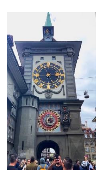
Zytglogge, Bern, Switzerland - Photo by Amy Van Artsdalen

locations were easily accessed by cog wheel trains and mountain gondolas. Later that day we enjoyed cheesy fondue at the end of a perfect day.