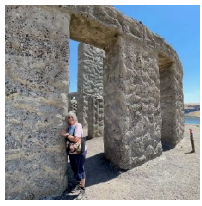
If you drive the less popular Washington side of the Columbia River, you can make a stop at Maryhill Stonehenge, a WW I memorial.

(L) Perhaps THE most interesting stop was the Experimental Breeder Reactor-I (EBR-I) Atomic Museum in Butte County, ID. Part of the Idaho National Laboratory, it was the first power plant to produce electricity using atomic energy ... IN 1951!!!