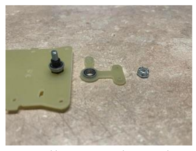
Second bearing pressed into crank