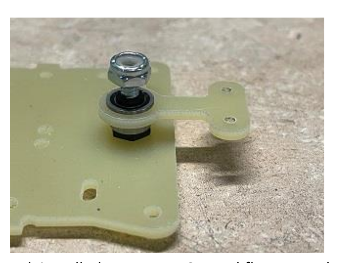
crank installed onto post. Second flange up also