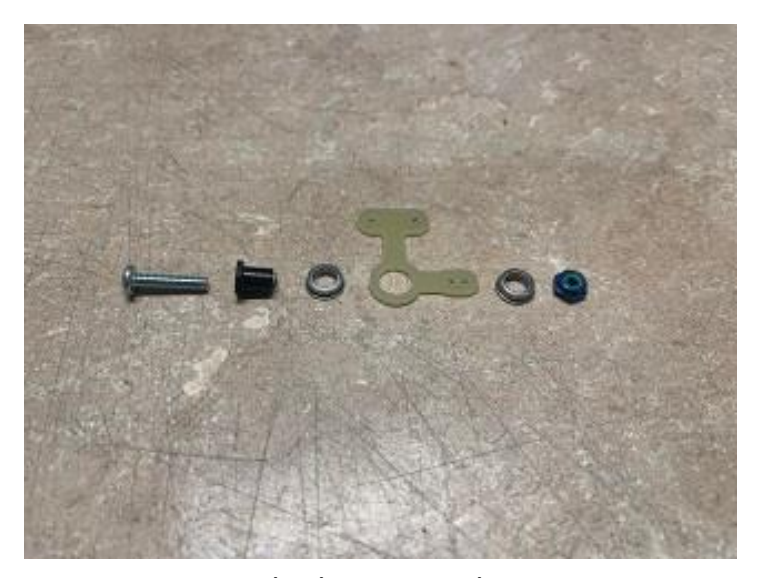
Parts laid out in order

Assemble as shown. Do NOT overtighten the flanged post. Doing so will cause the plastic to expand and the bearings will fit too tightly. Note that the colors of the parts have changed but the assembly remains the same.