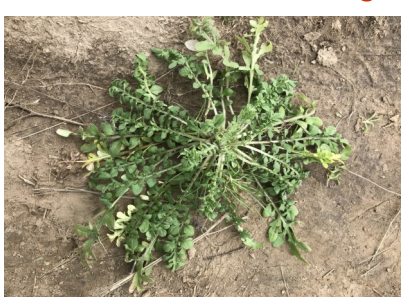
Diffuse Knapweed Rosette