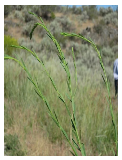
Spurge flax thrives in the same conditions as diffuse and Russian knapweeds. Small leathery leaves may impede the uptake of herbicide.