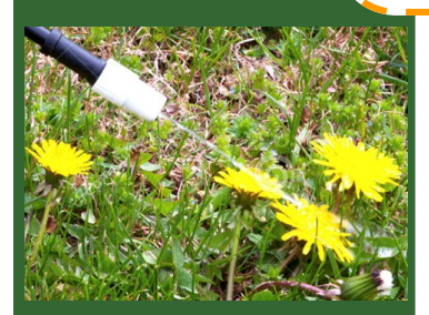
Have a post herbicide strategy to revegetate

The cost share will be distributed on a per acre basis to applicants satisfying program requirements. For information on participating in next years program contact the Weed Board office.