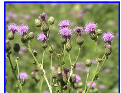
One plant can colonize an area 3 to 6 feet in diameter in one or two years.