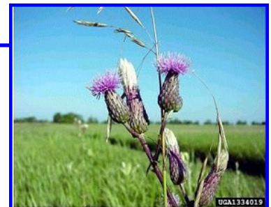
Some good news: If the plant is male, the seed in the fluff you see blowing in the wind is sterile.