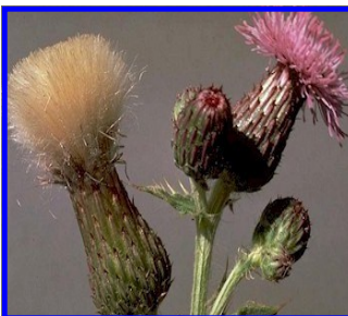
The pinkish purple blossom contains several hundred seeds, in a head similar to that of a Dandelion.