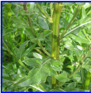
Stems are grooved and smooth to slightly hairy.