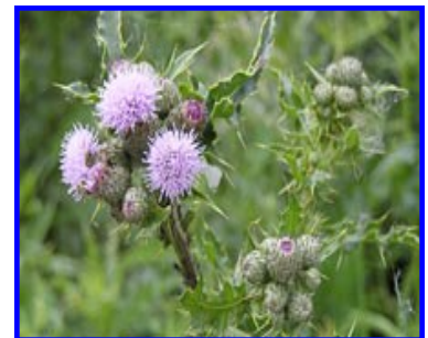
The flowers are pinkish purple and arranged in clusters.