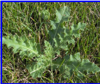
Rosettes form in late April through May.