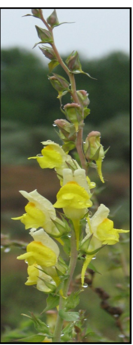
Dalmatian toadflax flowers resemble snapdragons

Dalmatian toadflax is an erect perennial forb reproducing by seed and creeping rootstock. Its deep taproot makes Dalmatian toadflax efficient in capturing water and withstanding grazing. It produces yellow snapdragon-like flowers June through October. Forage value is significantly reduced where large infestations exist.