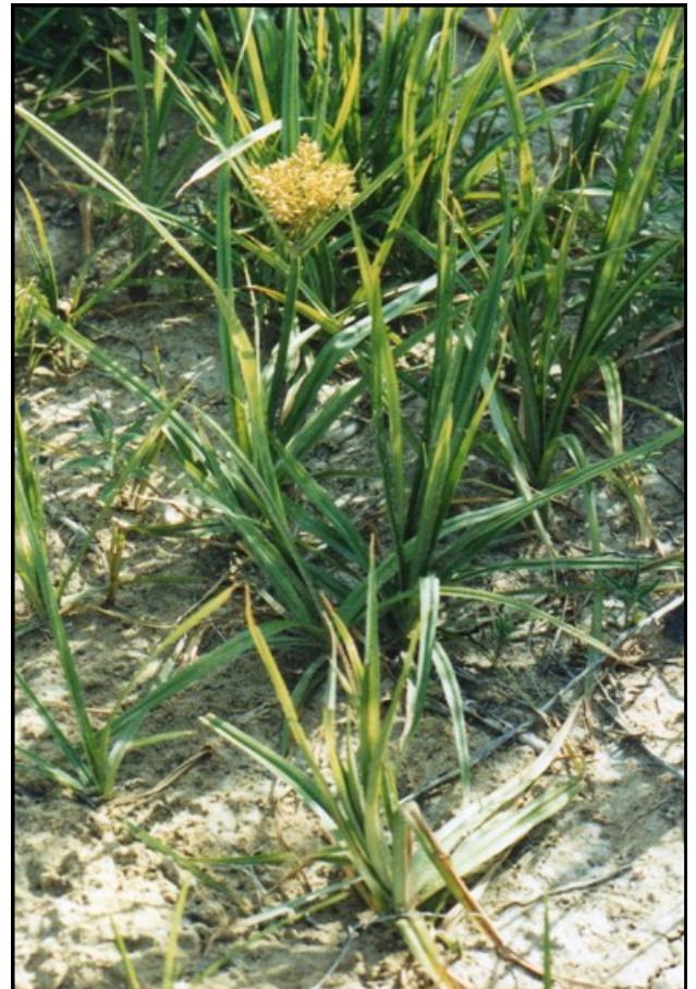
Yellow nutsedge produces a golden seed head, but reproduces primarily from underground tubers.

Yellow nutsedge is a Class B noxious weed in Franklin County requiring control. Yellow nutsedge is sometimes referred to as nutgrass however, it is not a grass. It belongs to the sedge family. Sedges differ from grasses in appearance and habitat preference. Most sedges have triangular stems and prefer cooler, wetter environments than grasses. Yellow nutsedge is widespread across much of the world and considered one of the most problematic weeds worldwide. It is highly adaptable to irrigated agricultural areas, roadsides, ditches and home landscapes. Reproduction occurs primarily from underground tubers that form at the end of underground stems called rhizomes. Plants begin to produce tubers at a very young age, typically by the time the plant has 6 or 7 leaves. A single plant can produce several hundred tubers during the summer. Yellow nutsedge can also spread by rhizomes. It produces a seedhead but its seeds rarely germinate. Tubers and rhizomes of yellow nutsedge can survive in the soil for 3-4 years.