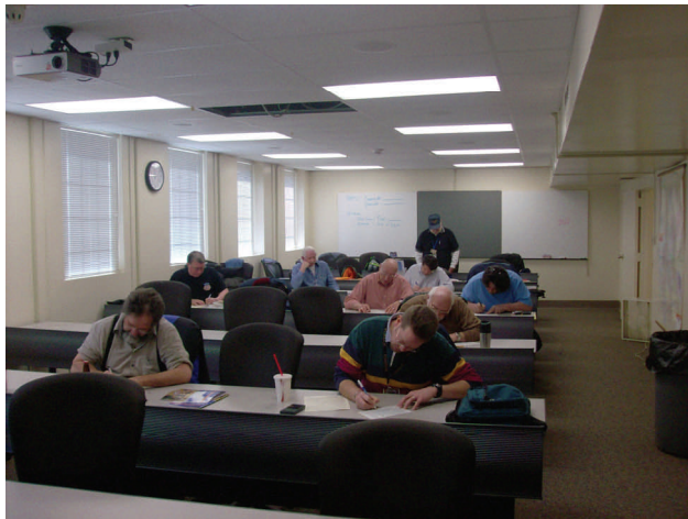
Class Exam Session