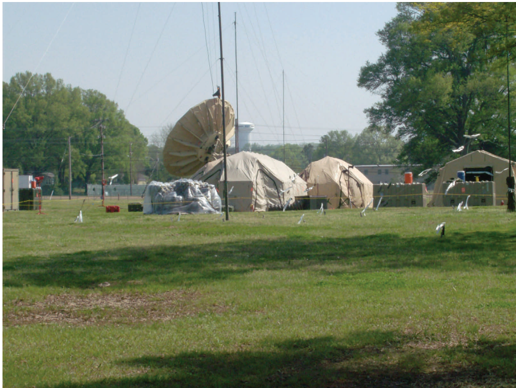
Army NG HF antennas.