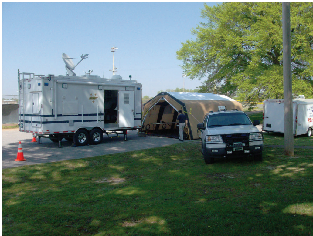
West TEMA trailer and operations tent.