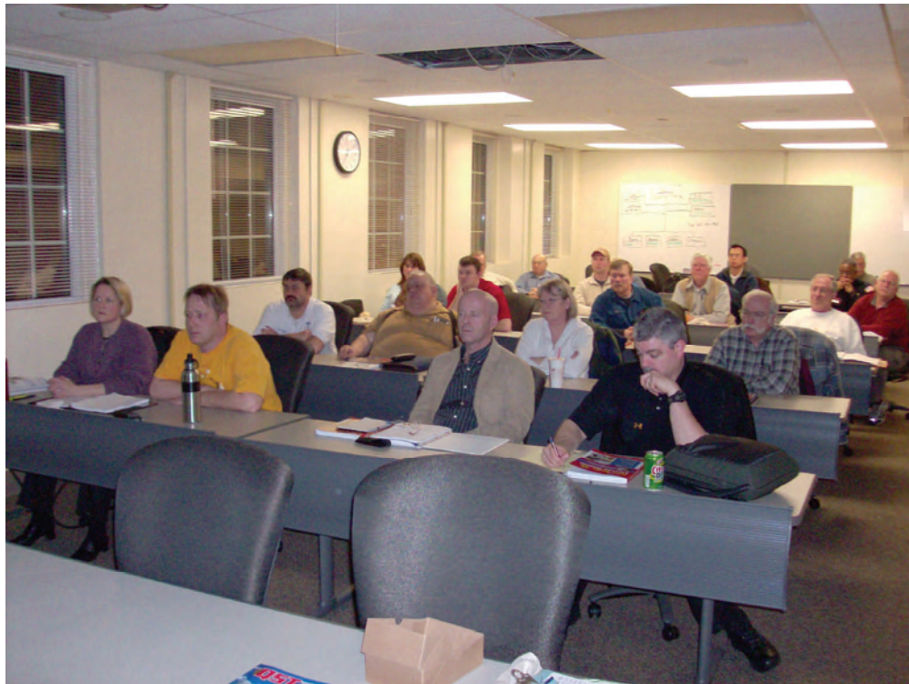
Technician-General Class 2-09 Left to Right: