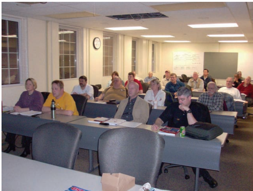
Technician-General Class 2-09 Left to Right:

A combined Amateur Radio Technician License and General License class in conjunction with Memphis-Shelby County Health Emergency Services Department began March 2 nd for 8 Monday nights from 6:15-9:30pm. There were 18 in the class; 10 Technician and 8 General students.