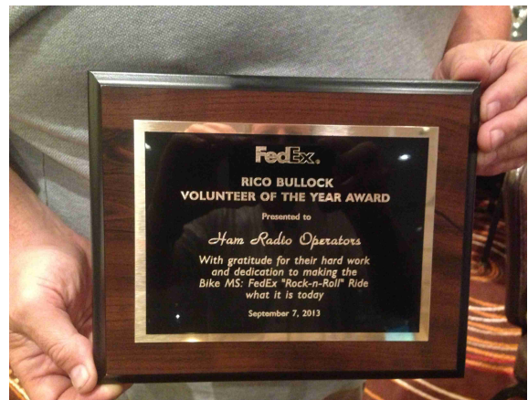
Rico Bullock Volunteer of the Year Award plaque