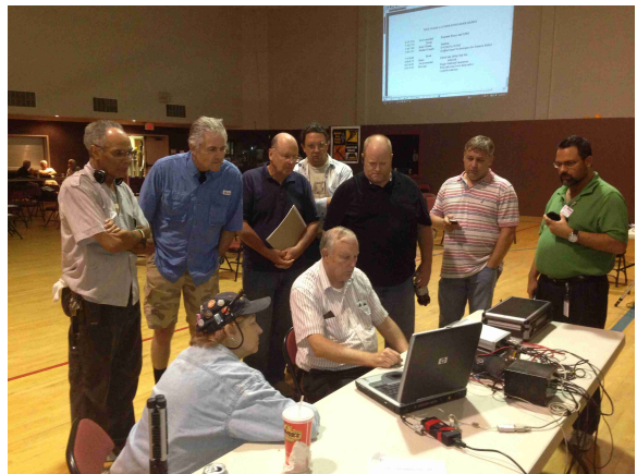
The 6th night was a repeater basics class with orientation on repeater use and programming, D-Star, Echolink, APRS, satellites, Winlink, and HF.