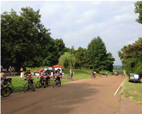
MS-150 at MS Earlene's house at the top of "the hill".