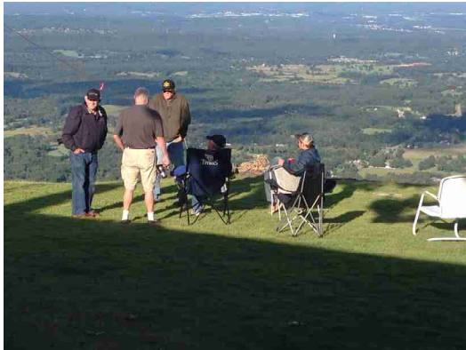
Photo looking northeast from Mount Nebo

The ARRL VHF/UHF Contest was held on September 13 th from 1pm to 10pm CDT on the 14 th . Each year a group goes over to