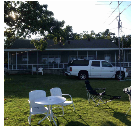
Primary tower with 6, 2, and 440 antennas