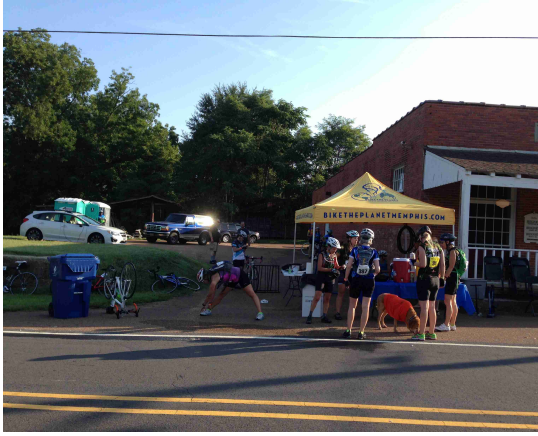
MS-150 Rest Stop One at Bridgeforth Realty