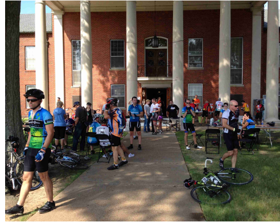
MS-150 Rest Stop 4 and lunch break at Hernando Court House.