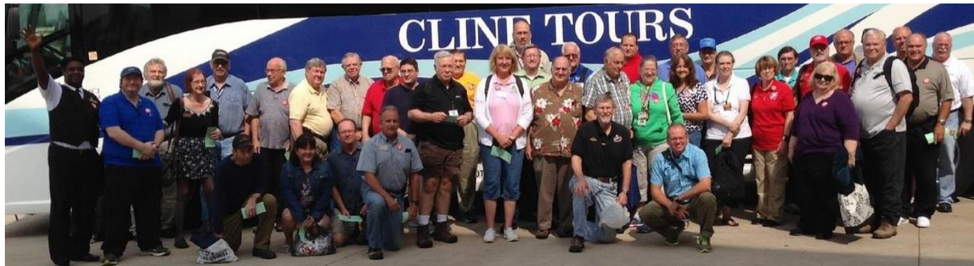
Riders to the 2015 Huntsville Hamfest