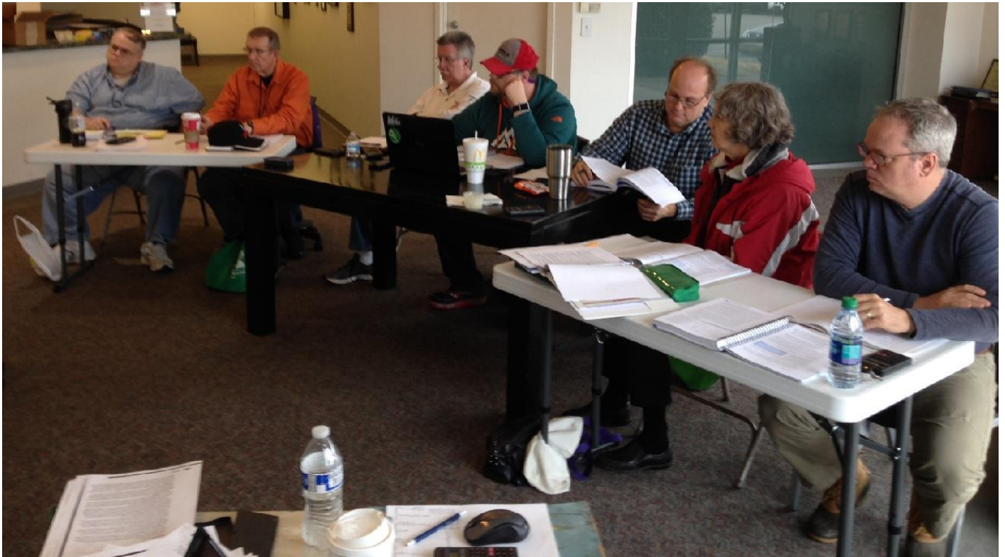
Extra Class 1-17.