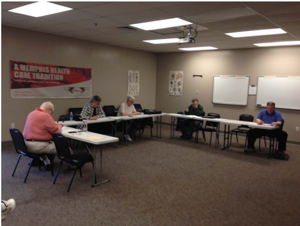
Extra Class 1-18 FCC test session