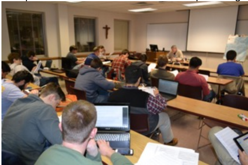
Tech Review Class at CBU