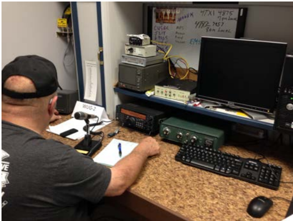
Ham W4GMM on the 20 Meter Station

Pictures from last year's Armed Forces Day Communications Exercise: