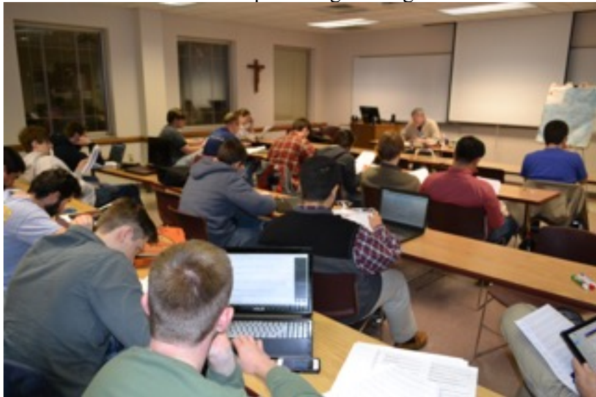
Tech Review Class at CBU