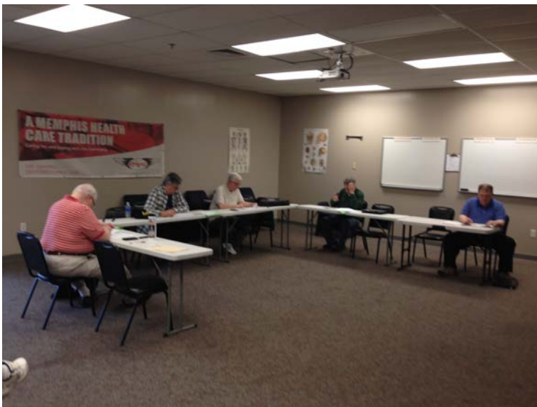
Extra Class 1-18 FCC test session