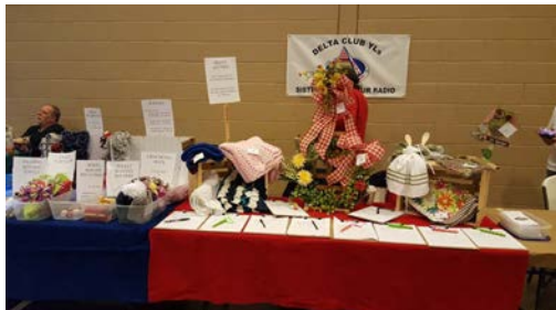
Our YL group had it together!