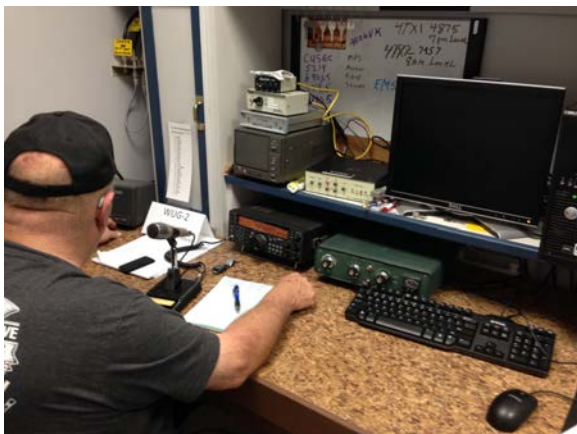
Ham W4GMM on the 20 Meter Station

Pictures from last year's Armed Forces Day Communications Exercise.