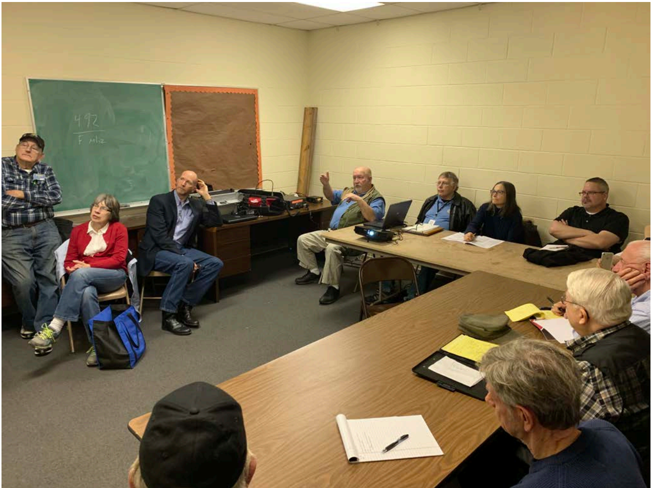
At the January meeting Ham discussed basic operations of an HF radio.

HQ 101 will meet at 5:30 pm on February 12, 2019 and the discussion will be CW operation. Bring a laptop if you want a CW program to load. (PCs only)