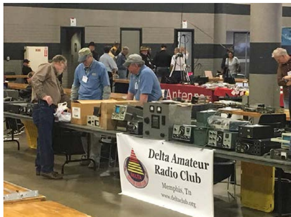
Showing off our DARC banner!