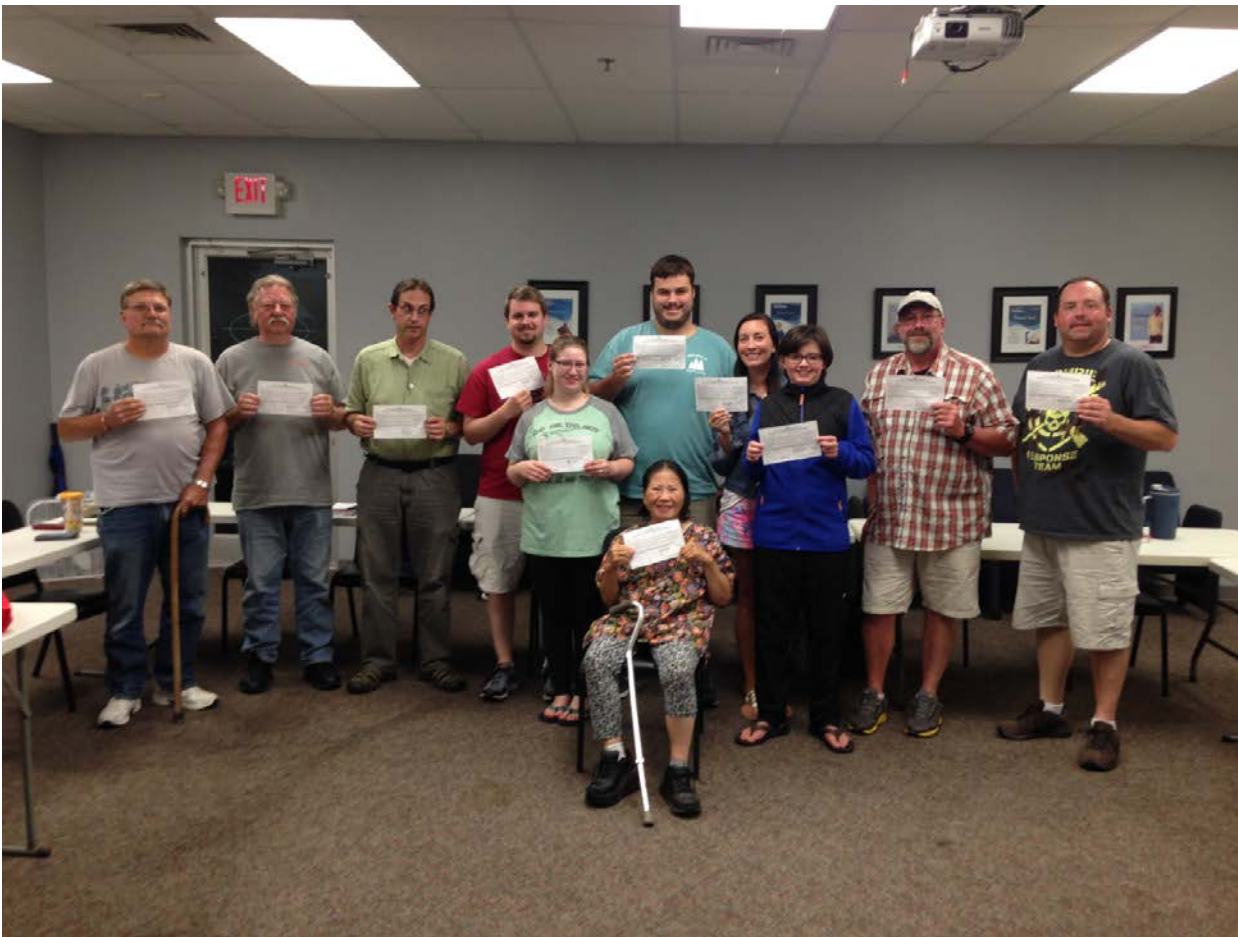
Tech Class 3-18 showing off their CSCEs.