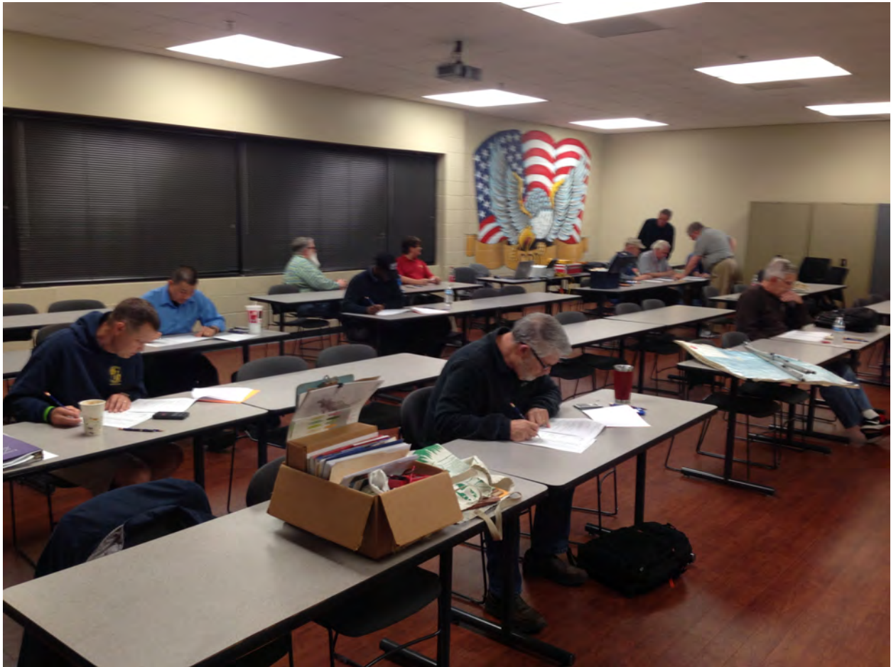
Tech Class 2-19 taking their FCC exam.