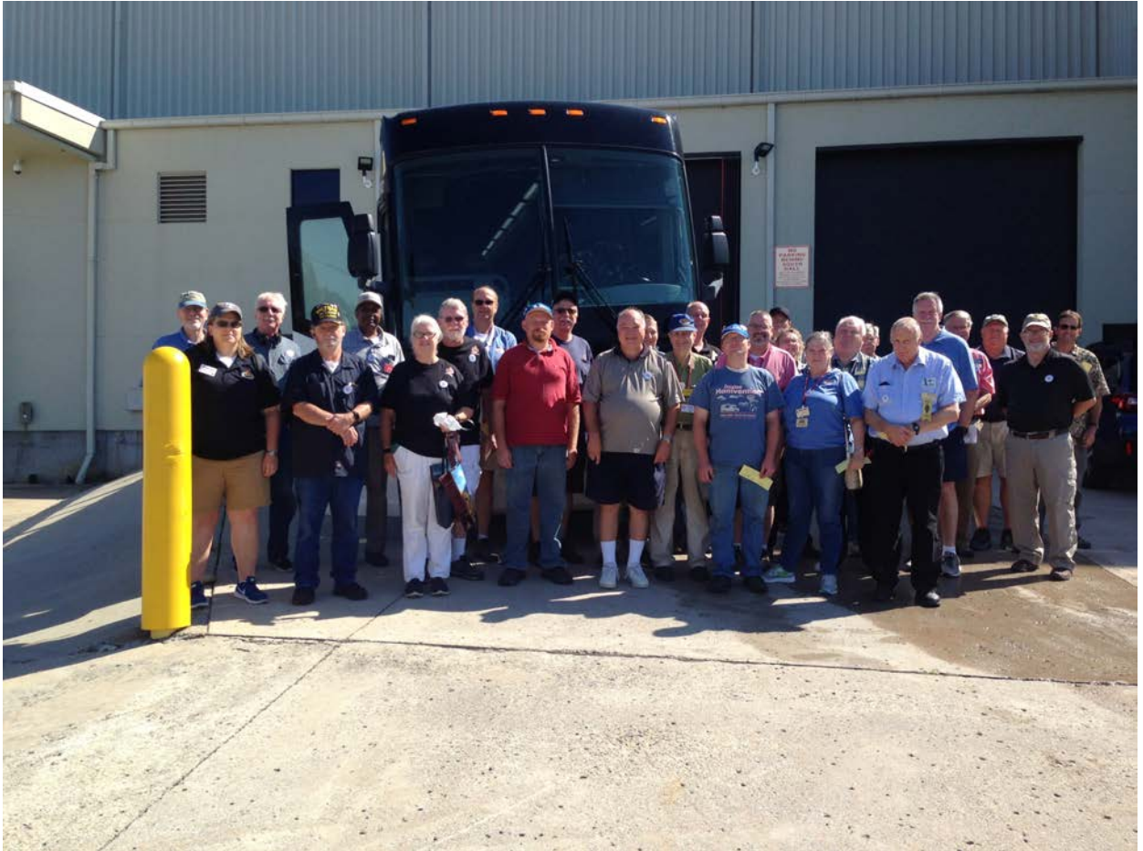
Arrival at the Von Braun Center South Hall loading dock

A bus load of hams went to the Huntsville Hamfest on August 17 th along with gear the club had obtained from several estates. We had table 312 to attract the hundreds of buyers at the hamfest.