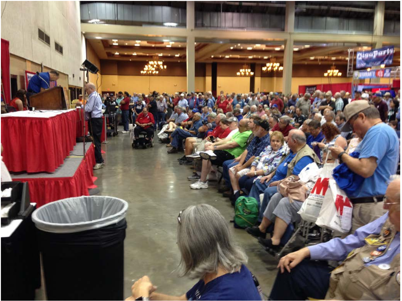
Huntsville Hamfest crowd waiting for the Grand Prize drawing on Saturday