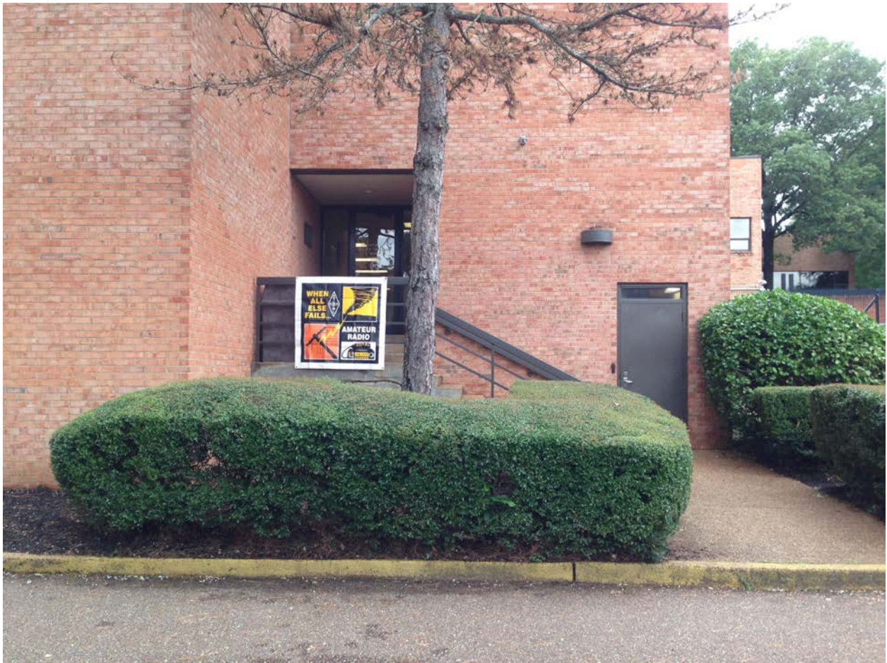
Entrance at Germantown Police Department for Tech Class 3-19

Tech Class 3-19 is being held on six Monday nights from July 8 th thru August 12 th from 6:15-9:30pm The location is at the Germantown Police Department training room, 1930 South Germantown Road. Eleven students originally registered for the class, two more became students, and two resigned. So, eleven students completed the class. There was one ham who audited the class.