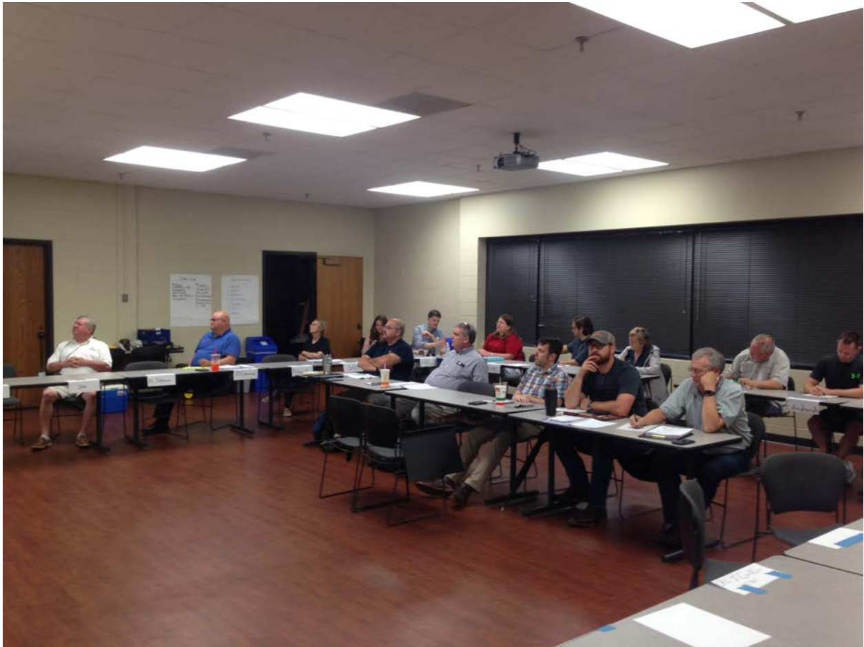
Tech Class 3-19