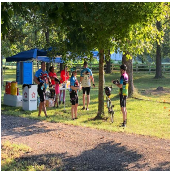
Rest Stop on Dean Road