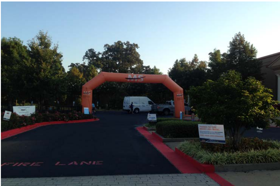
MS-150 start line at Landers Center, Southaven, MS

7 th and 8 th . The ride meandered from Landers Center in Southaven MS to Gold Strike Casino in Robinsonville, MS on Saturday and a different route back to Landers Center on Sunday. There were three different routes-a 33 mile short route, a 55 mile medium route and the 75 mile long one. The weather was clear skies and temperatures from the high 70s to the mid 90s both days- a hot dehydrating ride. Twenty four hams provided the communications.