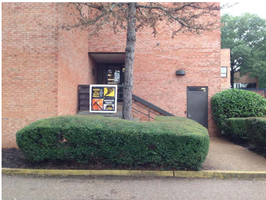
Entrance at Germantown Police Department for Tech Class 3-19

Tech Class 3-19 was held on six Monday nights from July 8 th thru August 12 th from 6:15-9:30pm The location was at the Germantown Police Department training room, 1930 South Germantown Road. Eleven students originally registered for the class, two more became students, and two resigned. So, eleven students completed the class. There was one ham who audited the class.