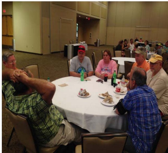
Some of the Hams at the end at Landers Center