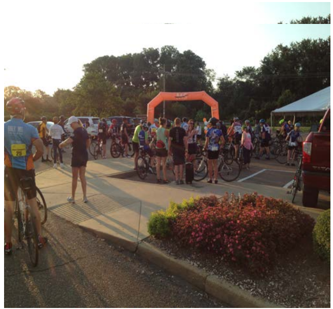
Start of Sunday MS-150 ride