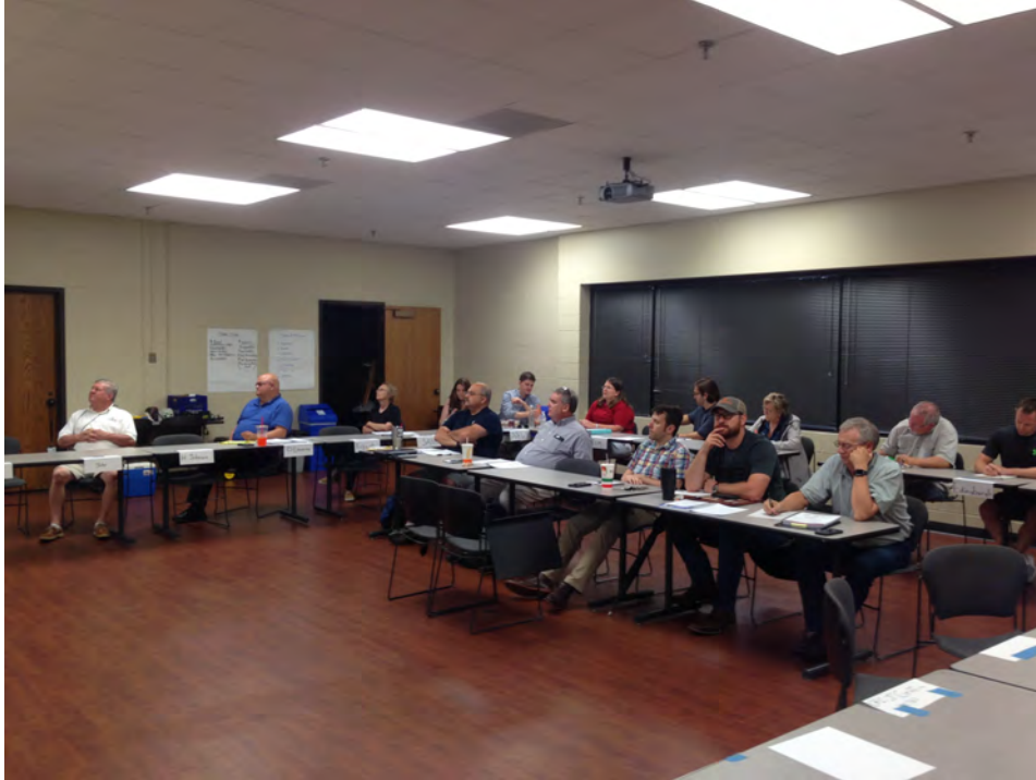
Tech Class 3-19