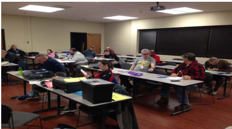
General Class 4-19 ARRL FCC Test Session