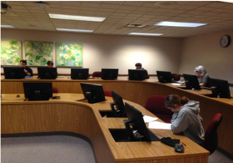
CBU Tech Review Class