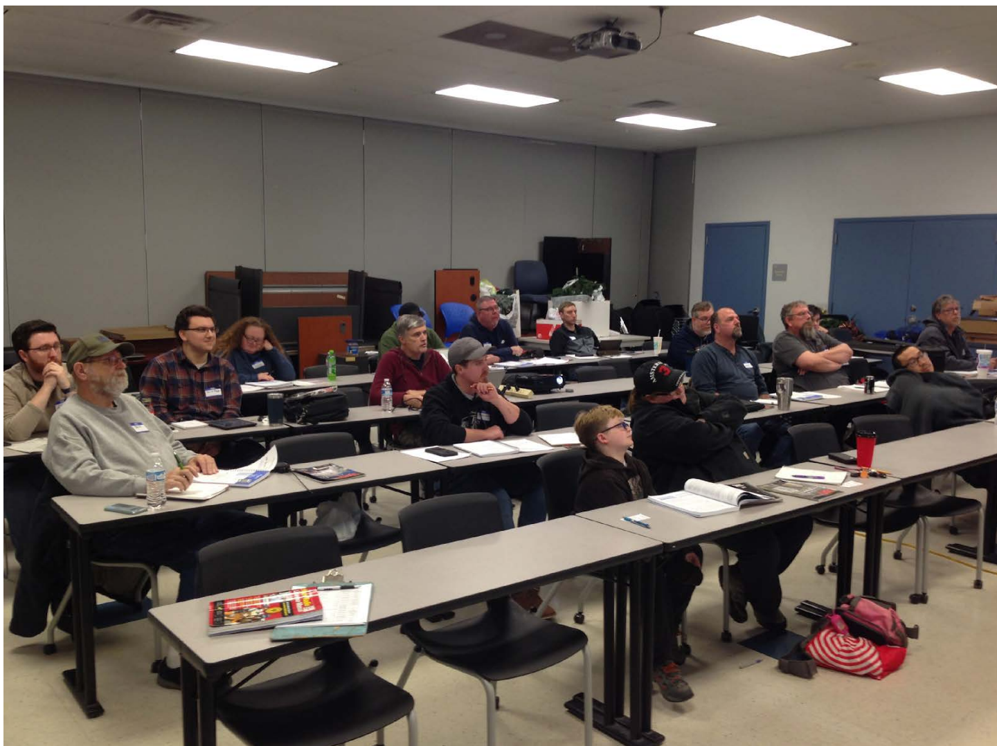
Tech Class 2-20 on first day of class.