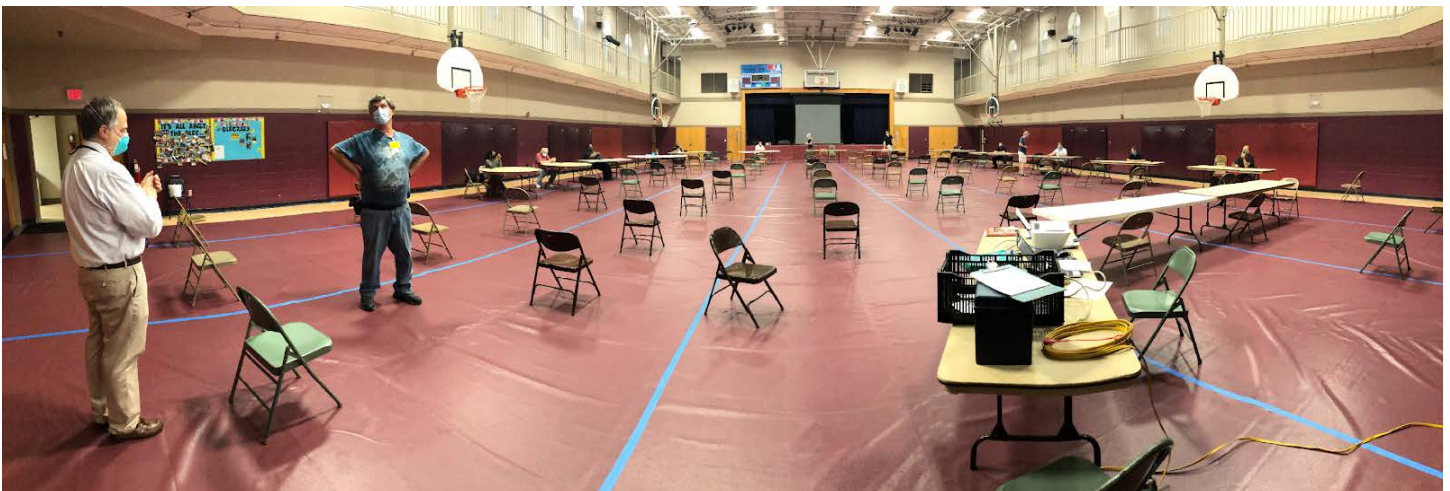
Tech Class 3-20 Test Session

Tech Class 3-20 is being held starting June 25 th on six Thursday nights from 6:15-9:30pm on a combination of Zoom online and planned in person classes. There are twelve students in the class. One of the students is eight years old. Both of his parents are in the class. The classes are being held on June 25, July 2, 9, 23, 30 and August 13. The Zoom classes continued thru the July 23rd class. The Laurel FCC test session was held in the gym at Germantown United Methodist Church, 2323 West Street, using social distancing.