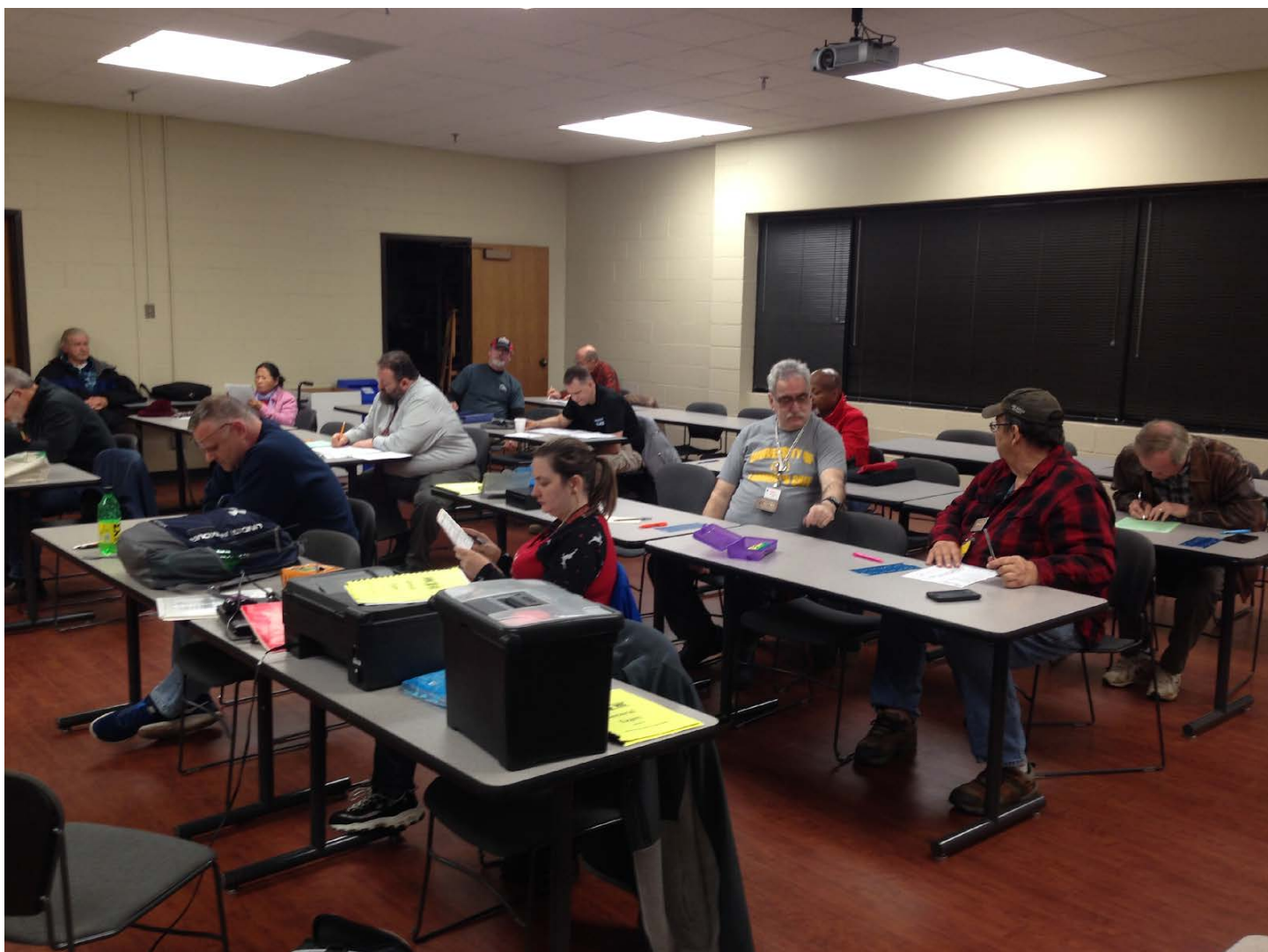
General Class 4-19 ARRL FCC Test Session