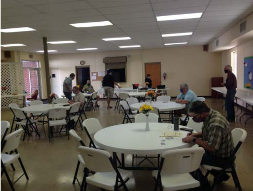
VE Test Session on October 10, 2020