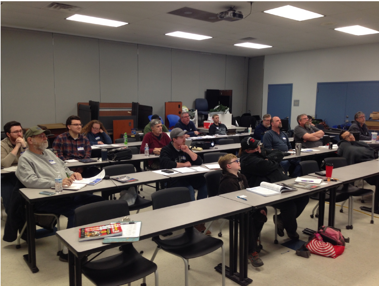
Tech Class 2-20 on first day of class.