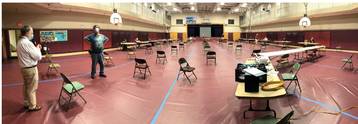
Tech Class 3-20 Test Session

Tech Class 3-20 is being held starting June 25 th on six Thursday nights from 6:15-9:30pm on a combination of Zoom online and planned in person classes. There are twelve students in the class. One of the students is eight years old. Both of his parents are in the class. The classes are being held on June 25, July 2, 9, 23, 30 and August 13. The Zoom classes continued thru the July 23 rd class. The Laurel FCC test session was held in the gym at Germantown United Methodist Church, 2323 West Street, using social distancing.