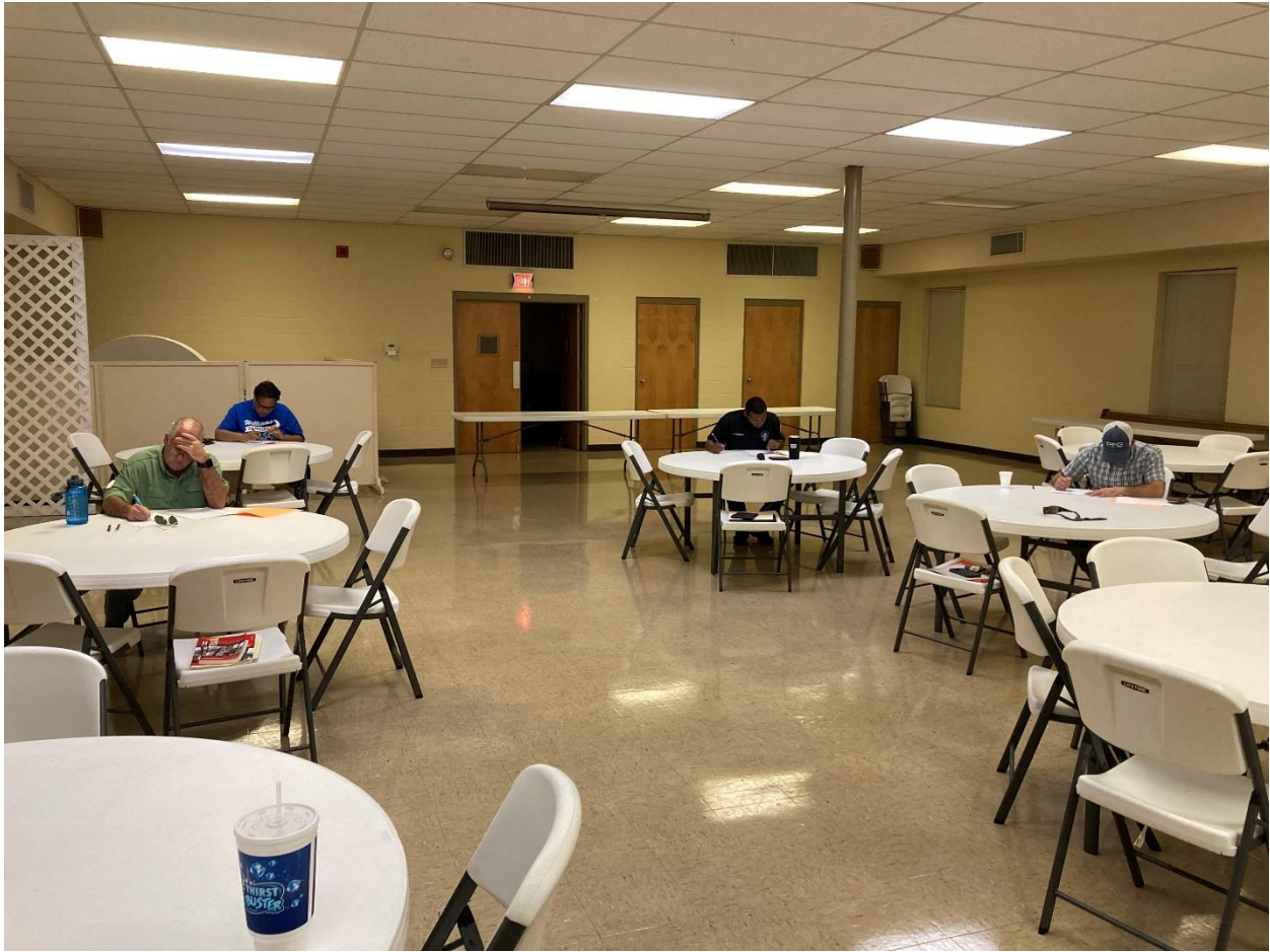
General Class 5-22 ARRL FCC test session