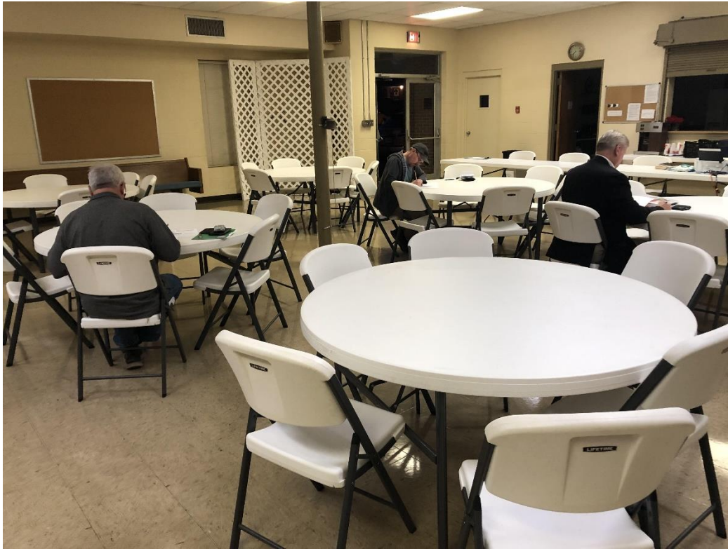
Tech Class 2-23 Testing