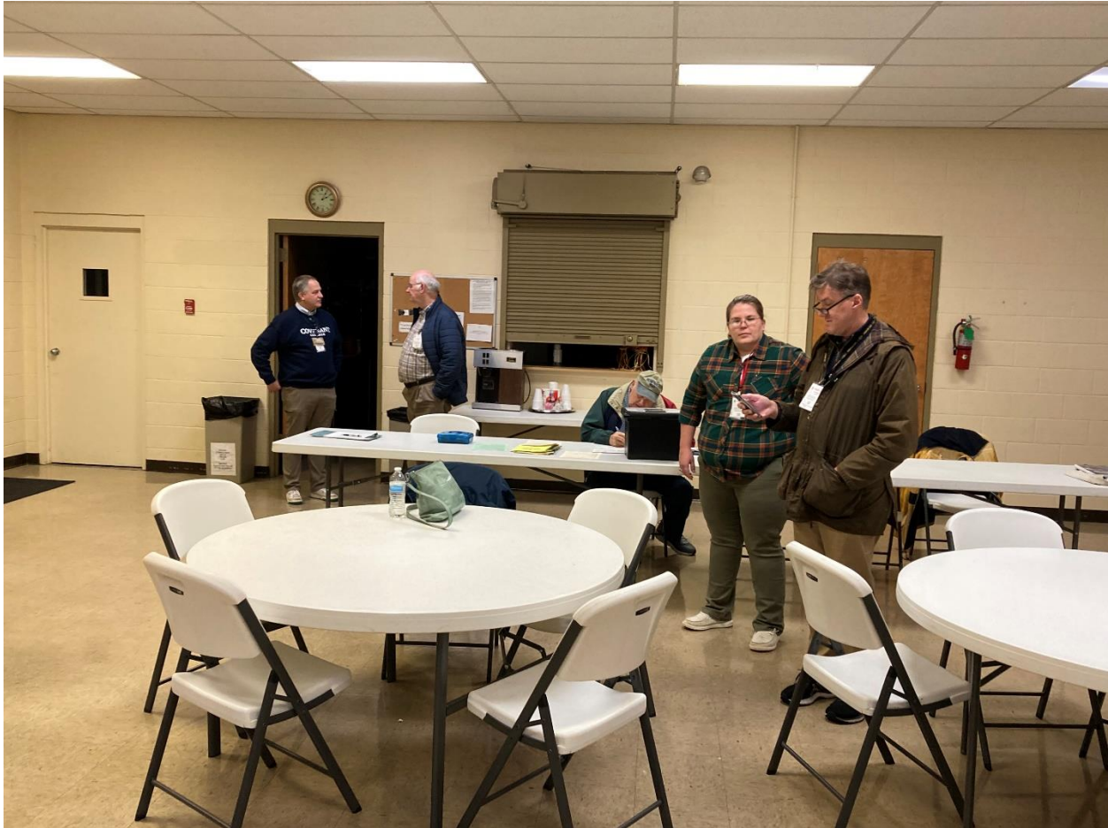
General Class 5-22 VEs