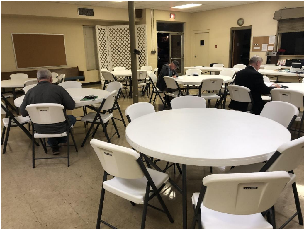
Tech Class 2-23 Testing