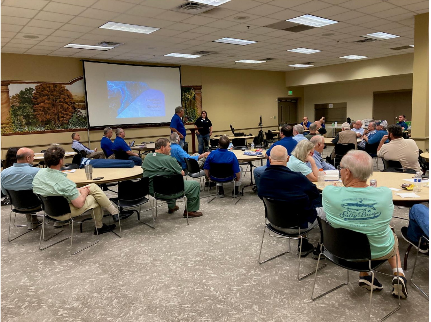
Photo of Delta Club meeting at Mid-America Theological Seminary