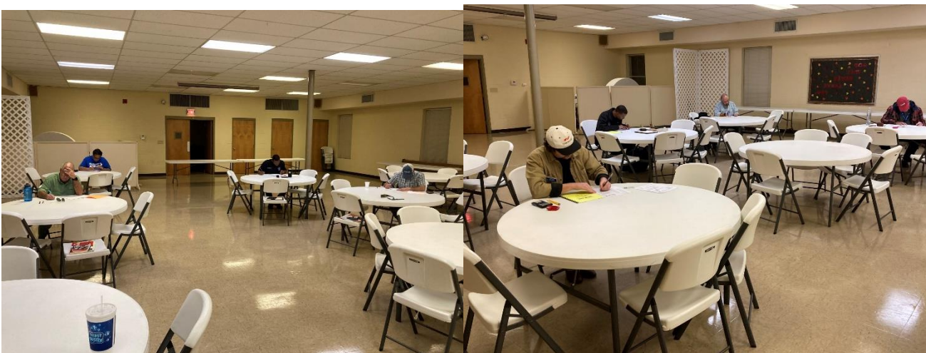
General Class 5-22 ARRL FCC test session