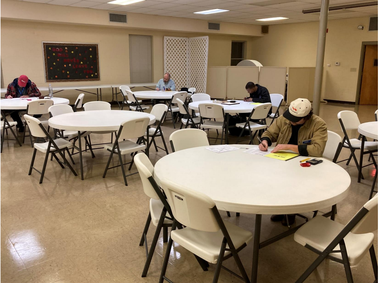
General Class 5-22 ARRL FCC test session