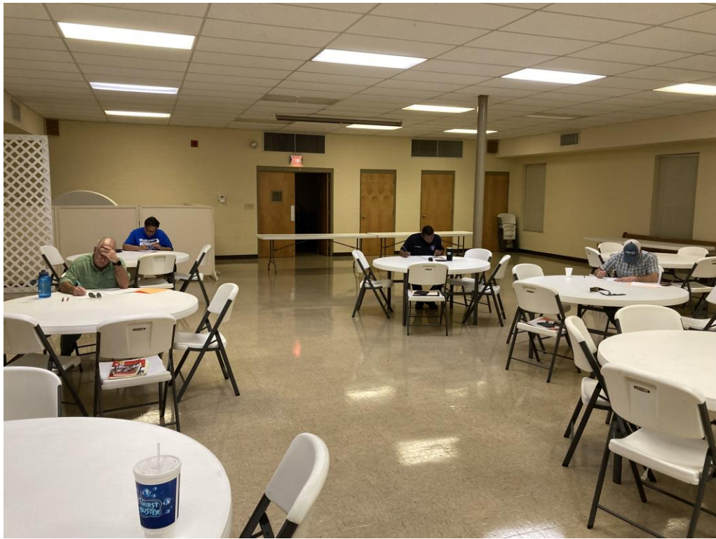
Tech Class 4-22 Testing