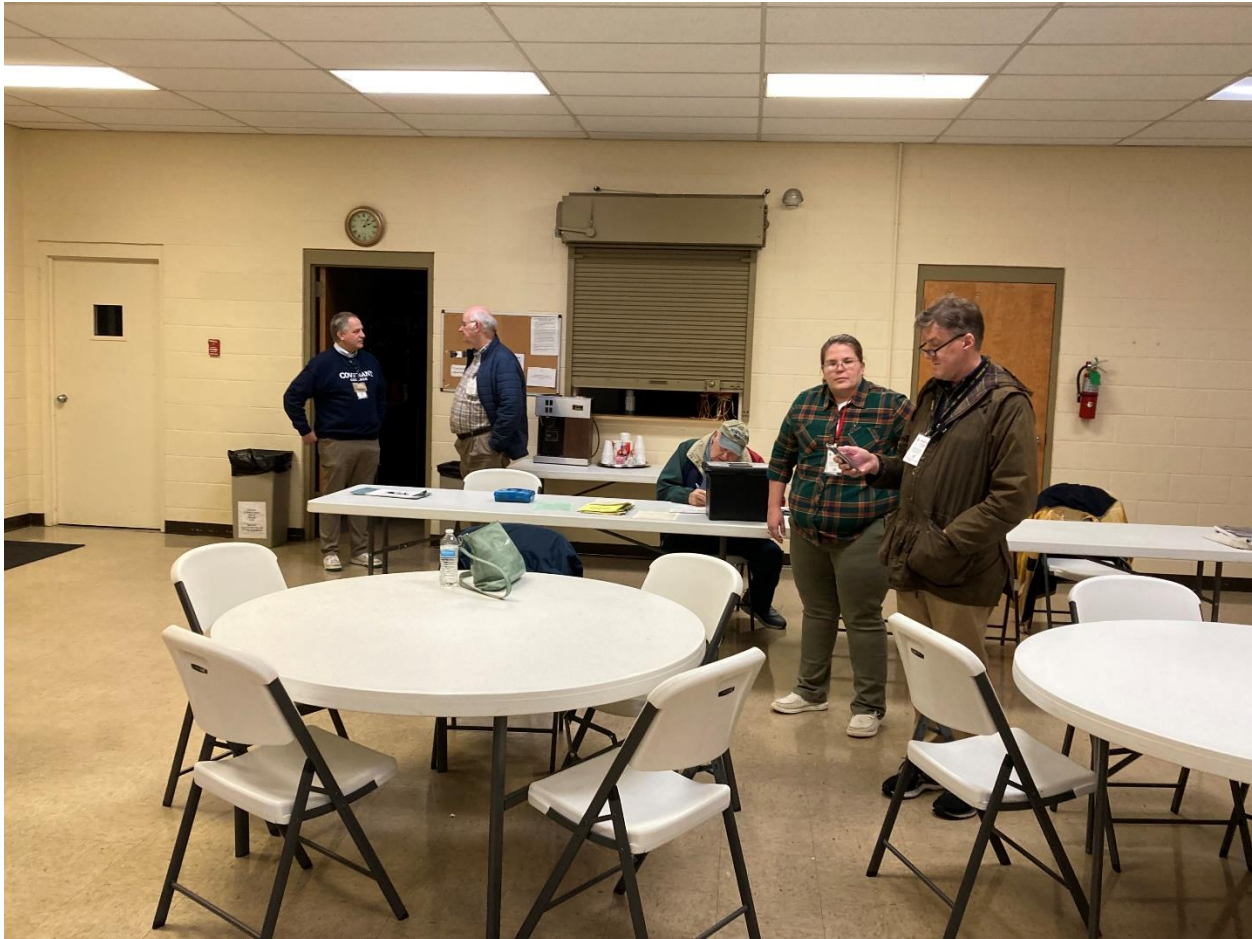
General Class 5-22 VEs