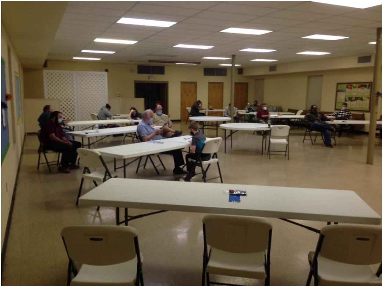
Tech Class 2-21 test session left side