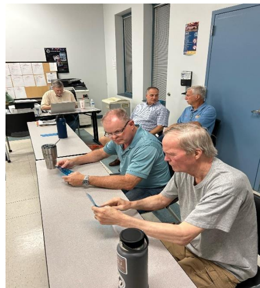
Tech Class 3-23 Testing