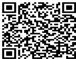
SCAN CODE TO DONATE TO ST. RENE GOUPIL

You now can donate to St. Rene Goupil using your cell phone! Just take a picture of the QR code in the gathering space or in the bulletin; it will automatically link you to the St. Rene donation site. Enter the amount you wish to donate, card information and press the “Pay” button. It’s that simple! We thank you for your generosity.