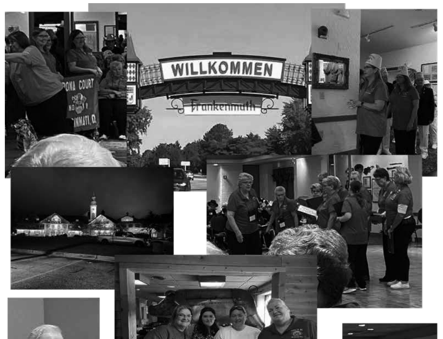
Bona Ct 8 -Great Lakes