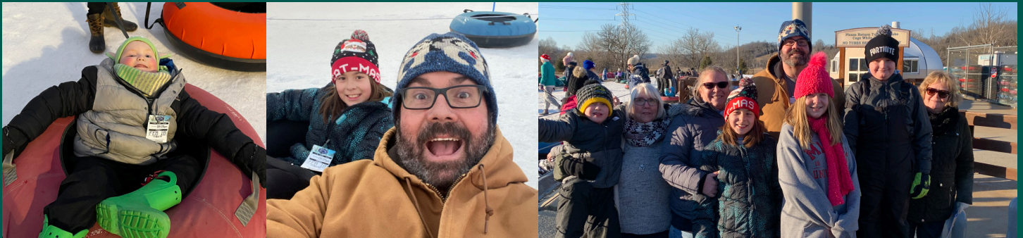
Perfect North Snow Tubing