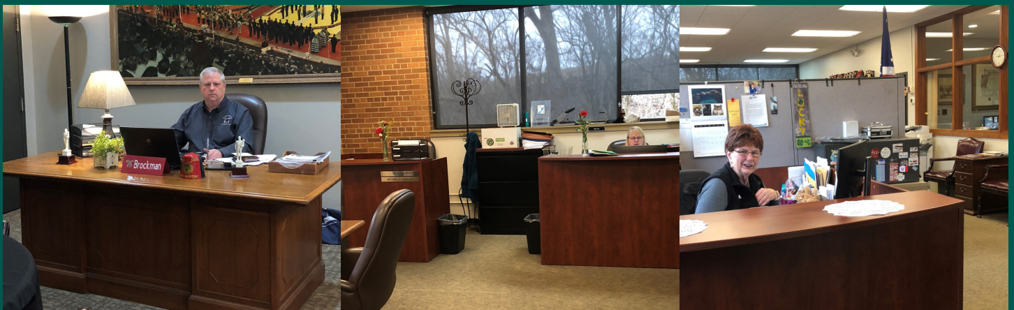
Syrian Shrine Office Renovations