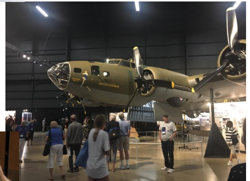
THE MEMPHIS BELLE