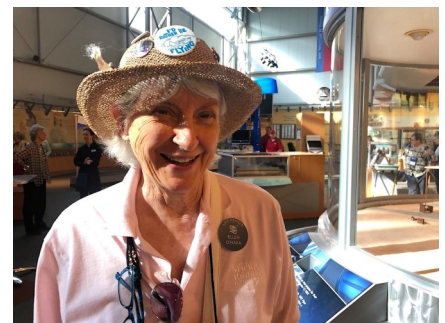
GOV. ELLEN BEFORE GIRL SCOUT DAY