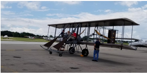
WRIGHT B FLYER ONE OF THE CONFERENCE TOUR CHOICES