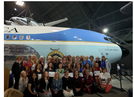
SCHOLARSHIP WINNERS AEMSF BANQUET