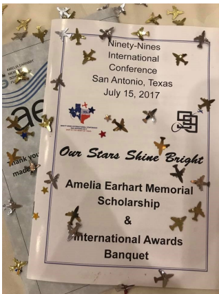
Program from our Scholarship and Awards Banquet

Women from all over the world who love to fly and love to share their enthusiasm assembled in San Antonio TX at the Westin Riverwalk and enjoyed!