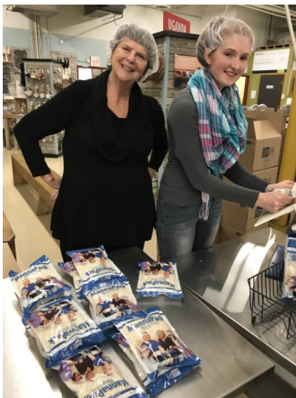
Filling the boxes with bags