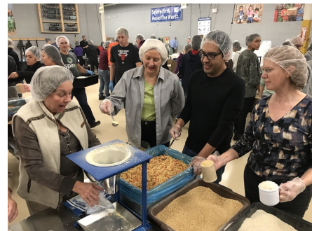
Filling the bags with product

Our Chapter had 9 active participants in this project, but the facility was filled with other volunteers. After some of us met for dinner, we drove to the site and were assigned the stylish headgear you see in the pix above. We were educated on the charity, and instructed in our duties. We washed our hands thoroughly and proceeded to our work stations. We moved into place and the music started when we did! We filled too many boxes to count, moving fast and yelling for more food and more boxes as quick as we filled them. Fun and fulfilling Lets do it again!