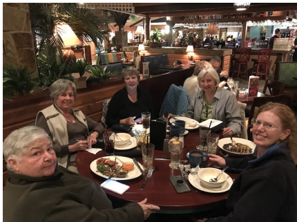
Dinner Before At Bahama Breeze

Feed My Starving Children Schaumburg November 16