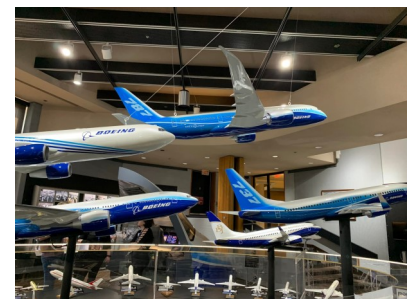
Boeing Prologue Tour