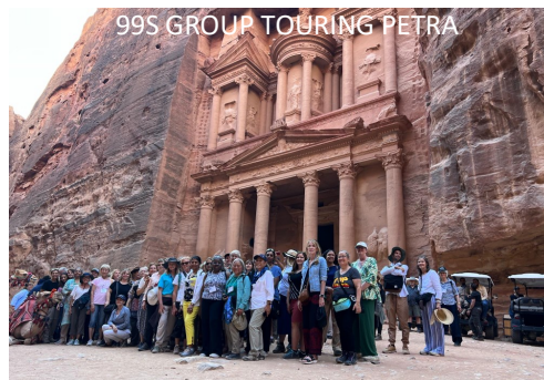
99S GROUP TOURING PETRA