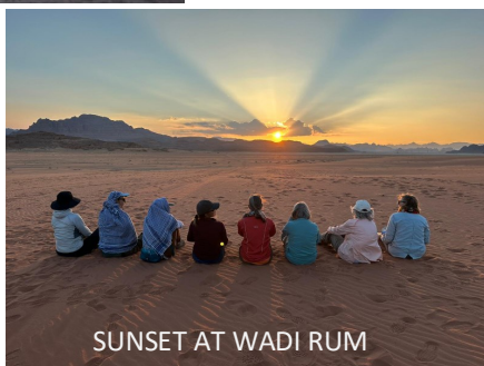
SUNSET AT WADI RUM