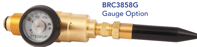
BRC3858G Gauge Option

We like to call this one cheap, but it is not in our vocabulary. It's IMPERIUM's™ High Quality, ECONOLINE™ Balloon Inflator offering bullet proof service, no frills, no options. All at a great price. Horizontal one piece handtight with integral cylinder connection threads leave you with one replacement part; the tilt valve.