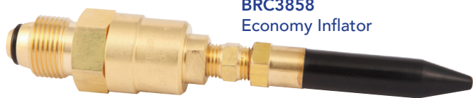
BRC3858 Economy Inflator