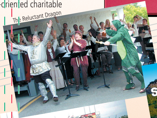
The Reluctant Dragon