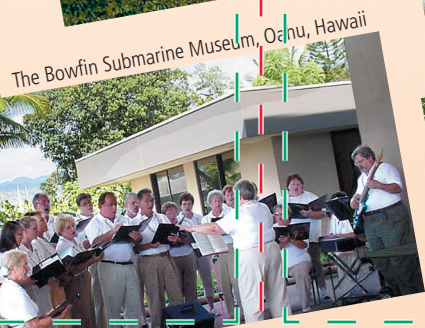
The Bowfin Submarine Museum, Oahu, Hawaii