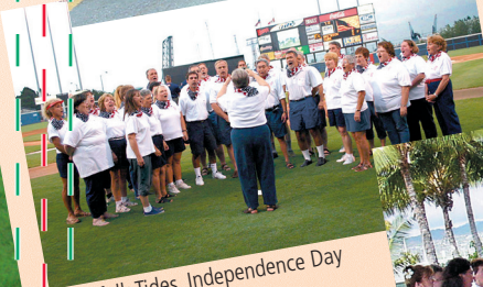
Norfolk Tides, Independence Day