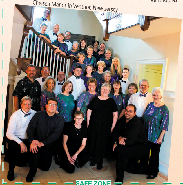
Chelsea Manor in Ventnor, New Jersey