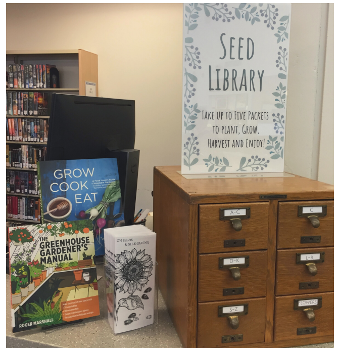
A SL doesn't need to be big or elaborate to be successful! The display for the East Lansing Public Library fits on a small stand near the checkout counter.