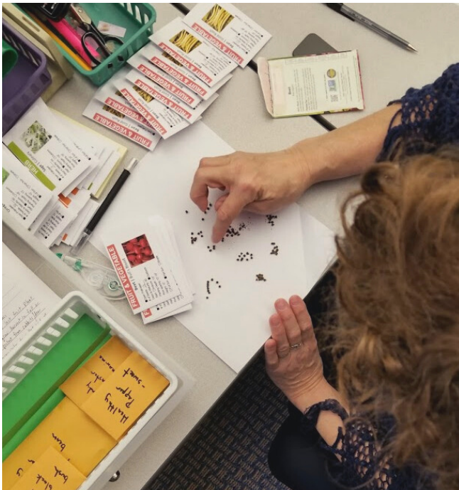
Sorting and packing seed at HDL. Staff are working on getting a more consistent, trained group of volunteers.