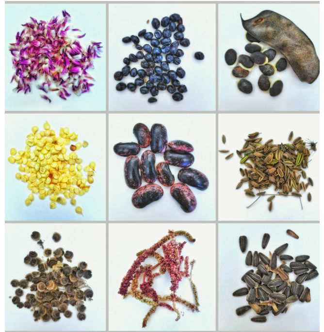
How will your community shape your collection? These are some of the donations the Herrick District SL received in 2018.

Managing such a large SL presents some challenges. To help ensure that staff at each location is familiar with how the SL works, system-wide trainings are held. How-to information for patrons is posted at SL displays and on the library's website. They are beginning to think about how they can simplify things.