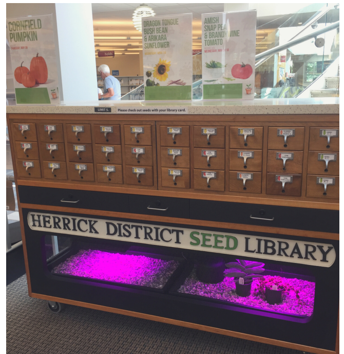
SL Display at Herrick's main branch. The display is located near the entrance, with lights and brightly-colored signs that attract attention.

Information is recorded about the number of different varieties and seed types offered, donations received, how many seed packets staff create throughout the season, and more.