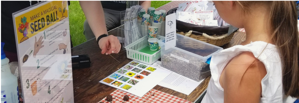
To promote their library, the Herrick District SL had a table at their summer festival where children could make a seed ball. How can you get your community engaged?