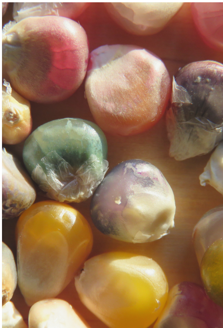
Glass gem popcorn saved by a small farmer in Michigan.

MORE RESOURCES 10 Potential Seed Donors MI Seed Purveyors MI SL Groups & Websites Seedy Events in MI