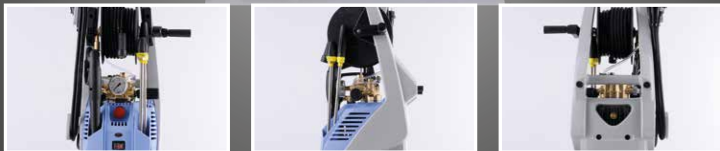
Figures: K 2160 TST

Pressure regulation Fully adjustable control allows operating pressures to be set to suit any task