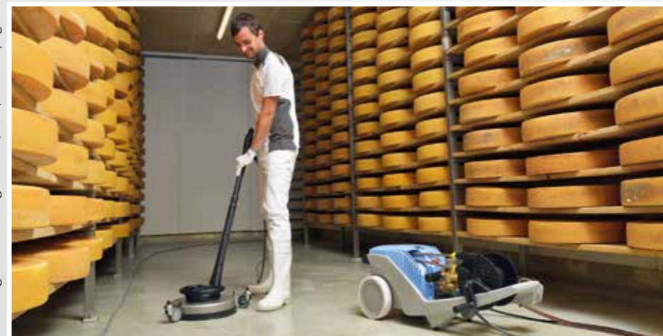
Fig. Non-marking version (NoM). Info on page 58