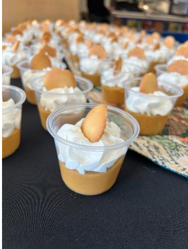
The menu featured roasted turkey, mashed potatoes with gravy, stuffing, green beans, cranberry sauce, and freshly baked dinner rolls, followed by pumpkin pie pudding parfaits.