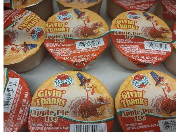
The students at Central were delighted with the turkey & mashed potatoes with gravy! Many said they could eat this meal every day! The Apple Pie Ice was enjoyed by all!