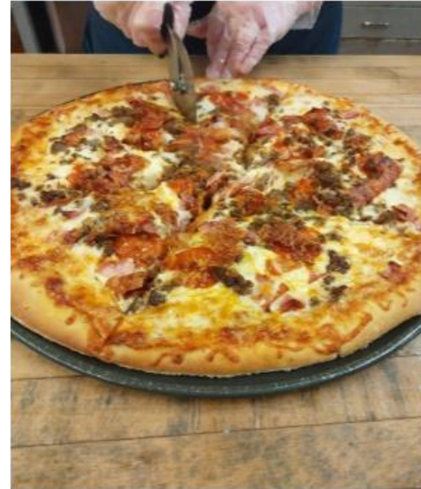
Mary's Meatlover's Pizza and our Ala Carte specials, including our "new" glazed donut & festive Veteran's Day donuts.

Participation is over budget for both breakfast and lunch, although ala carte sales struggle as a result of money not being put into student accounts due to meals being free. Continued ala carte specials and pop-ups will continue to be a focus to help drive ala carte sales.