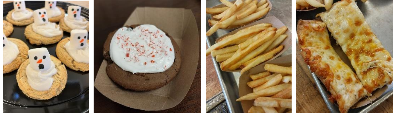
Beth's Melting Snowman Cookie and Peppermint Chocolate Cookie were creative and festive!

Pictured are several ala carte specials along with a few pop-ups that were available this month.