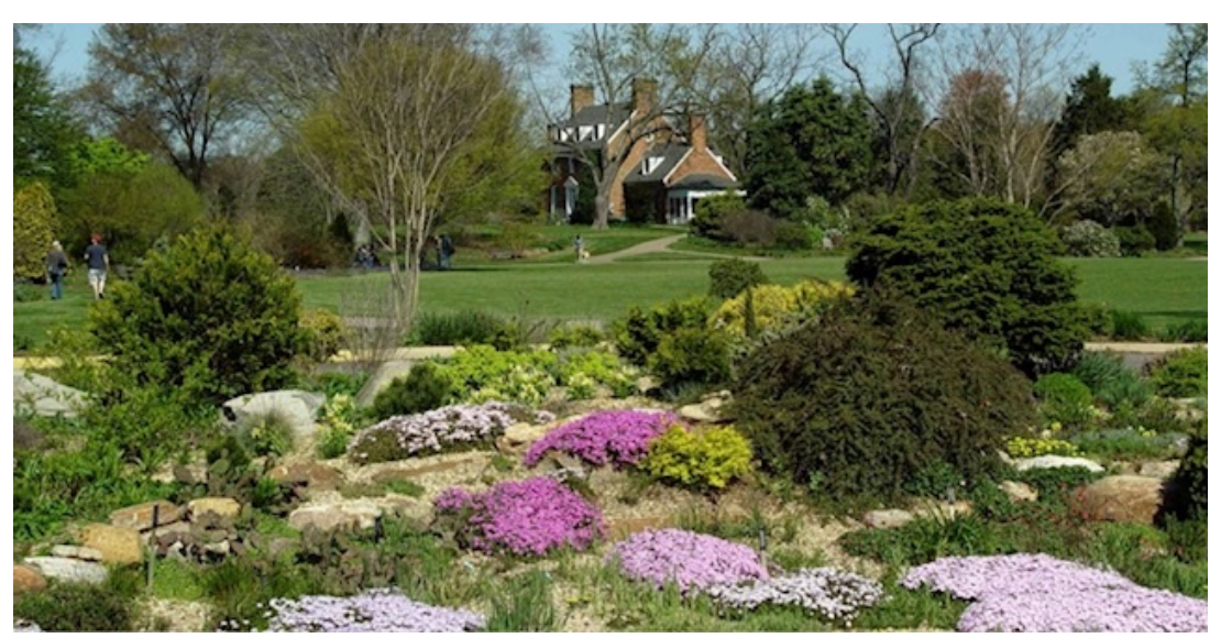
Green Spring Gardens Park (click on photo for more information)