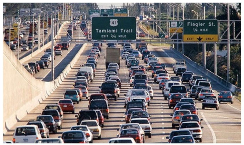
"The horse is here to stay but the automobile is only a novelty - a fad." The President of Michigan Savings Bank declining to invest in the Ford Motor Co., 1903