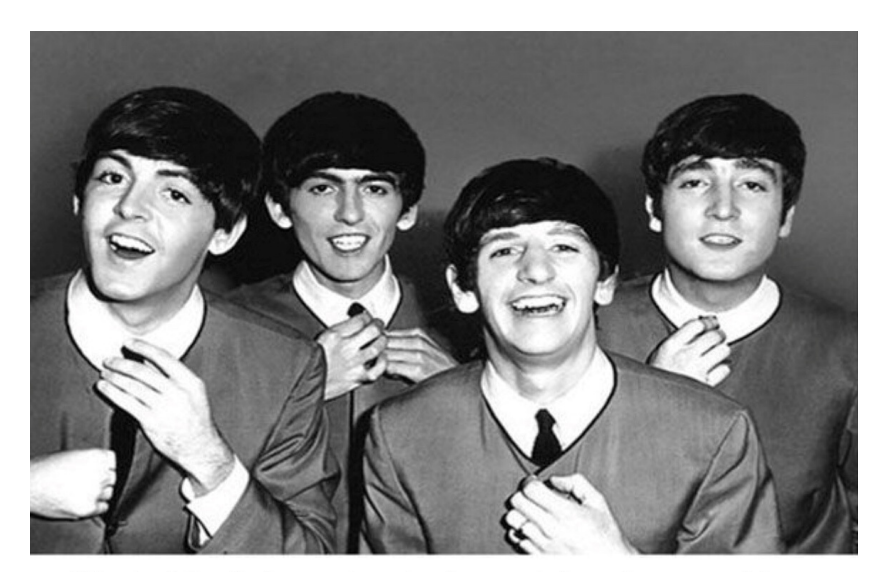
"We don't like their sound, and guitar music is on the way out." Decca Records on declining to sign the Beatles, 1962.