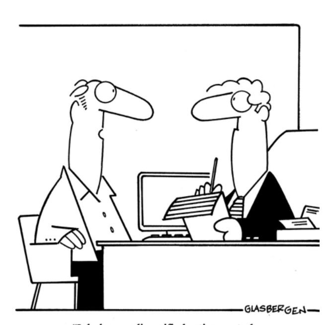
"I do have a diversified retirement plan: 30% hopes, 30% wishes, 40% prayers."

A: Instead of lying about your age, you start bragging about it!