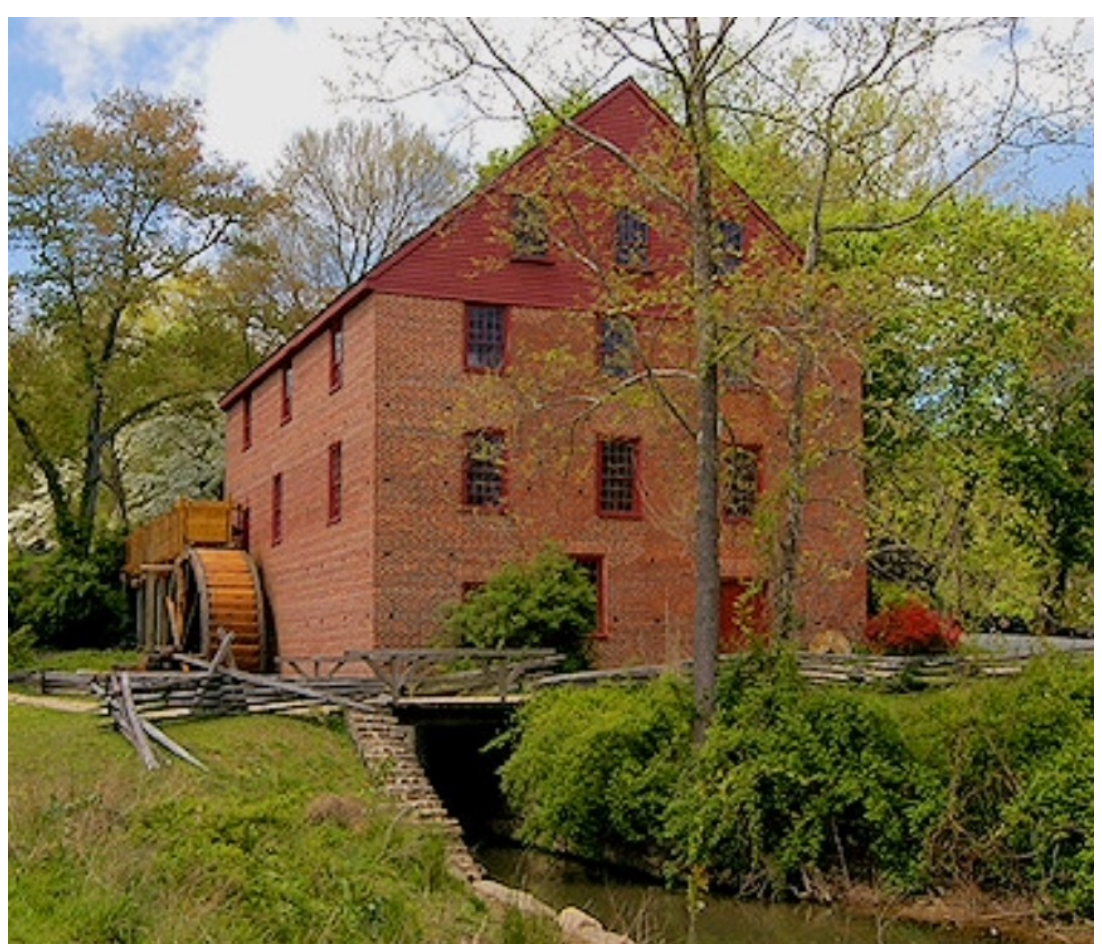
Colvin Run Mill, Great Falls - click on image for more information